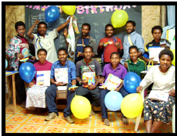
Hooray! School's out!